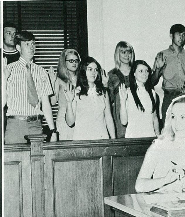
The competent jury is sworn in.