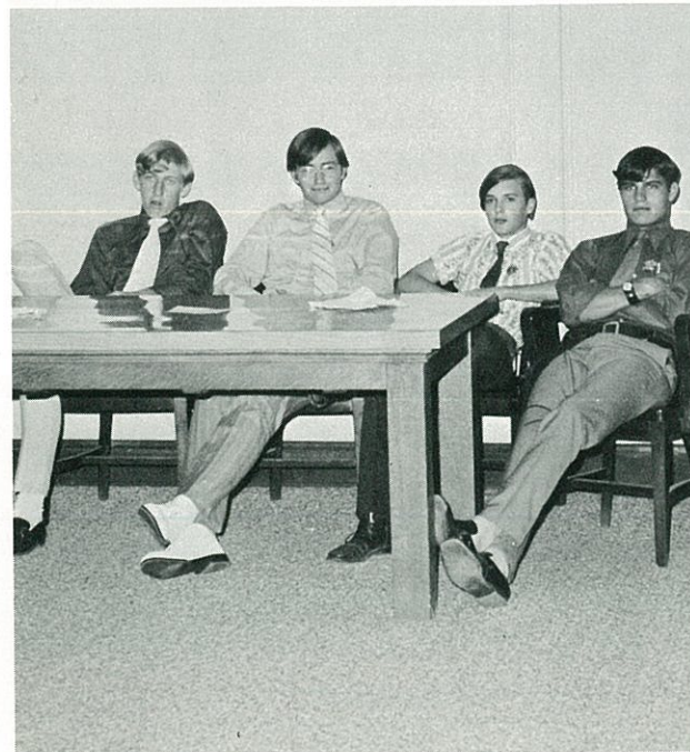
These outstanding Senior boys served as County Officials.