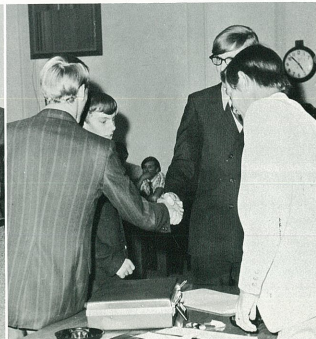
Congratulations are in store for the defense council.